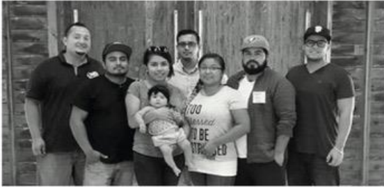
Crosswalk Worship Band